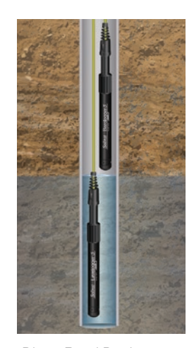
Direct Read Deployment