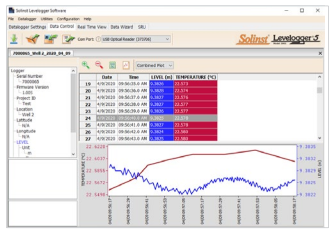
Data Control Window